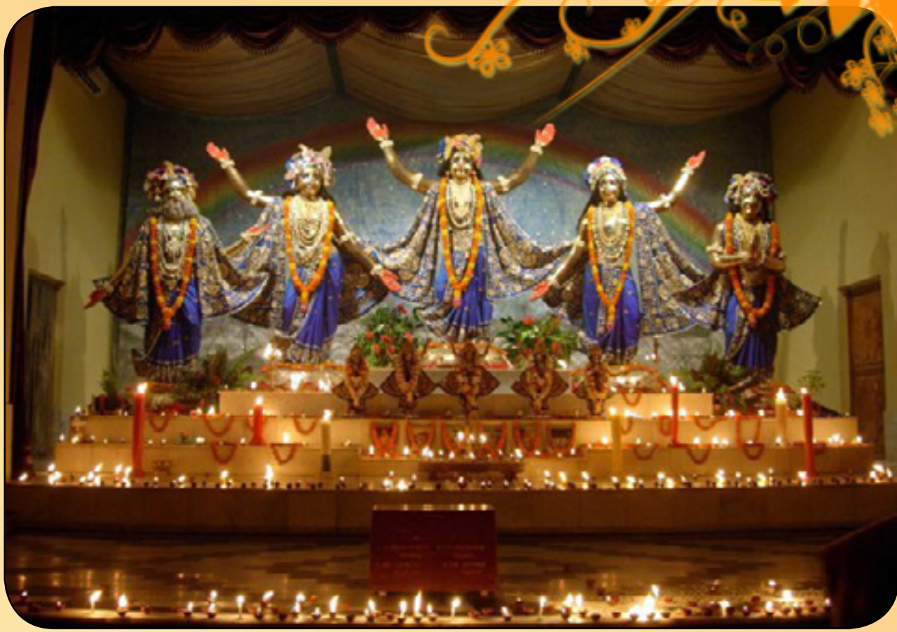
Pancha-Tattva Sadhya-Aratik during Domodara Mas

A prominent theme in this pastime is the glorification of the relationship of love between the Lord and His devotees. Love is a concept which often means different things to different people. The great saint Krishnadas Kaviraja has given