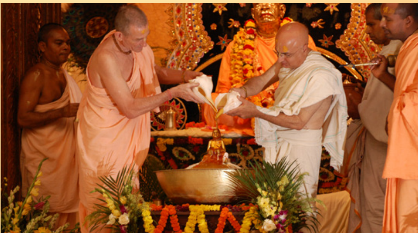
Srila Prabhupada's Disappearance Day Abhishek