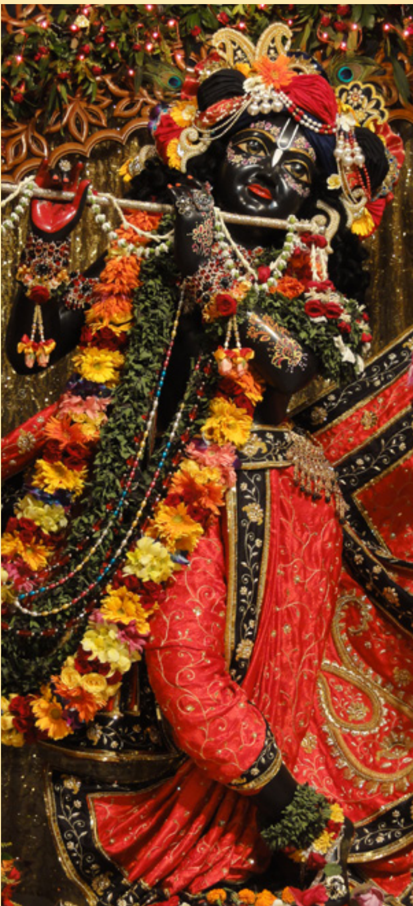
Sri Madhava Janmastami Vesh