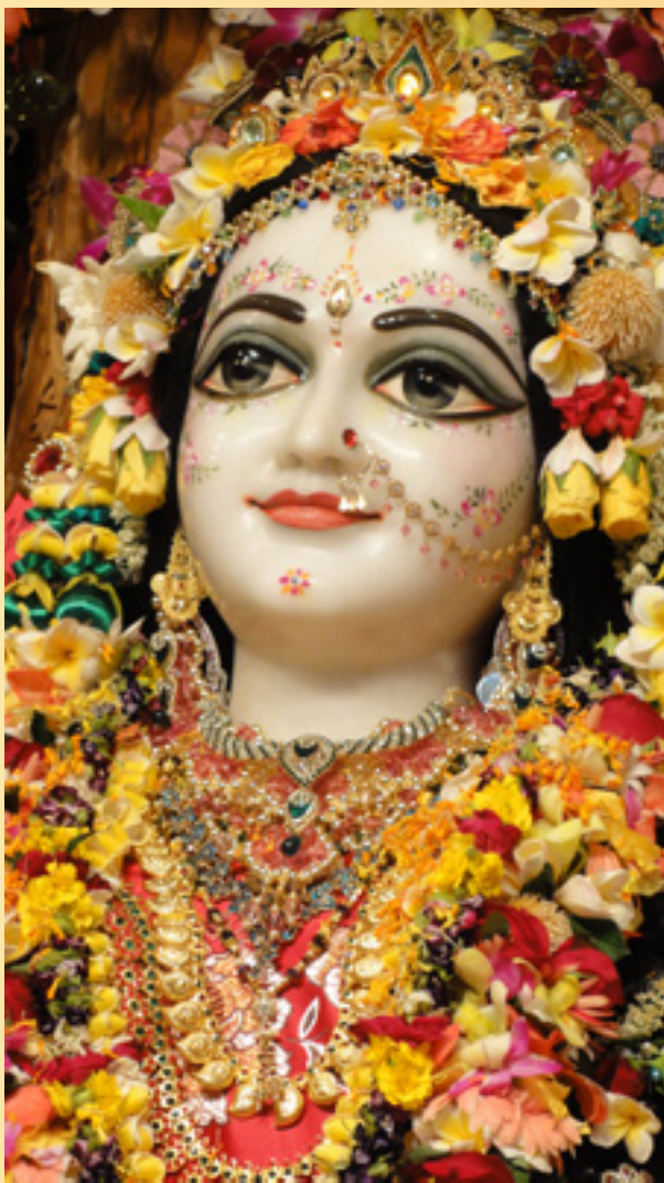
Srimati Radharani Radhastami Vesh