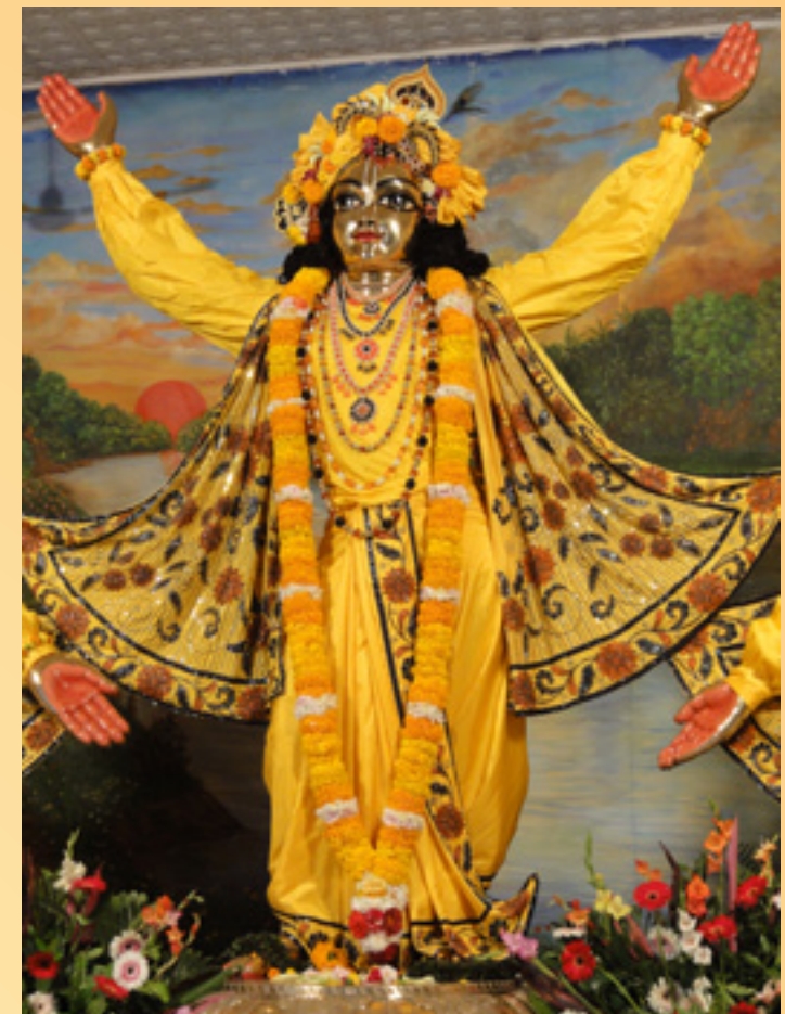
Gauranga Mahaprabhu Deity at ISKCON Mayapur