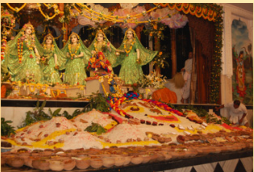
Govardhan Puja Anna-Koot