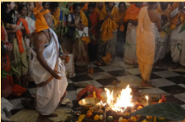
Gita Jayanti Homa