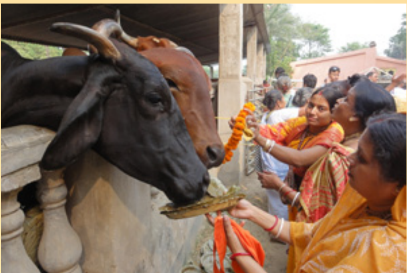
Gopastami Feeding of Cows at Goshala