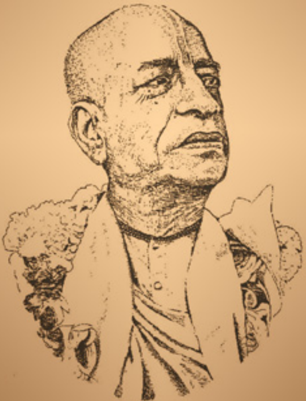
Dedicated to His Divine Grace A.C. Bhaktivedanta Swami Prabhupada