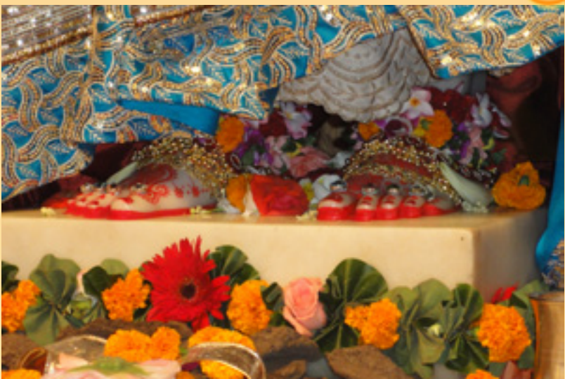
Gopastami Srimati Radharani Charan Darshan