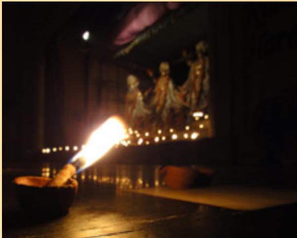
Sri Pancha-Tattva Altar Damodara Arati