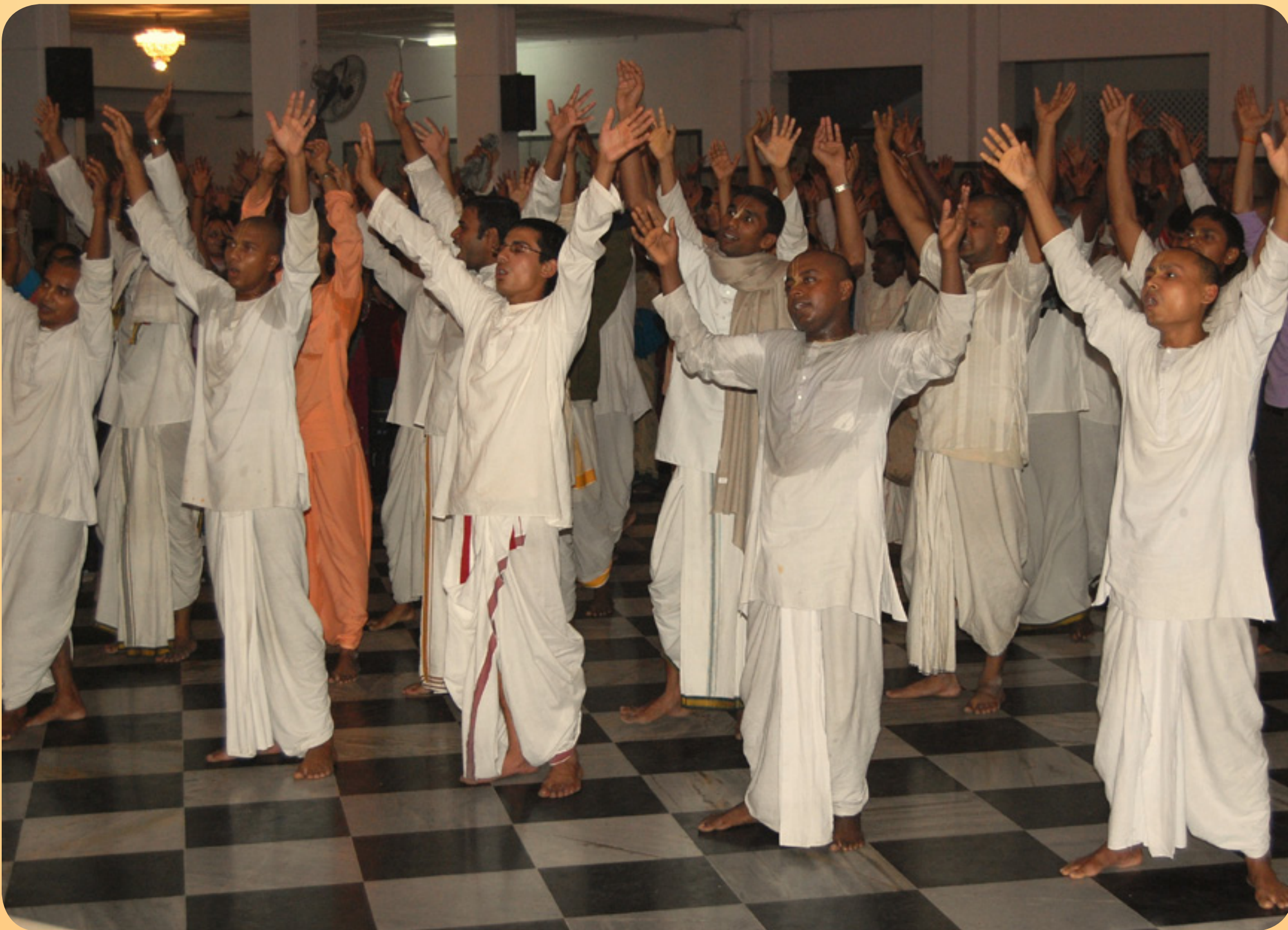
Mayapur Sandhya Aratika

If this evening festivity is approached with a prayerful and respectful mood the resultant precious benefits are incalculable. During your next visit to Mayapur we invite you to join us every evening for this very special event! Additionally, when you are not in Mayapur you can log onto Mayapur.com click the link for MayapurTV and participate in the live festivities from your own home!