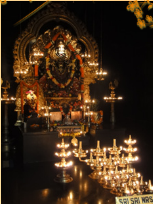
Sri Sri Prahalad Nrisimhadev Damodara Arati