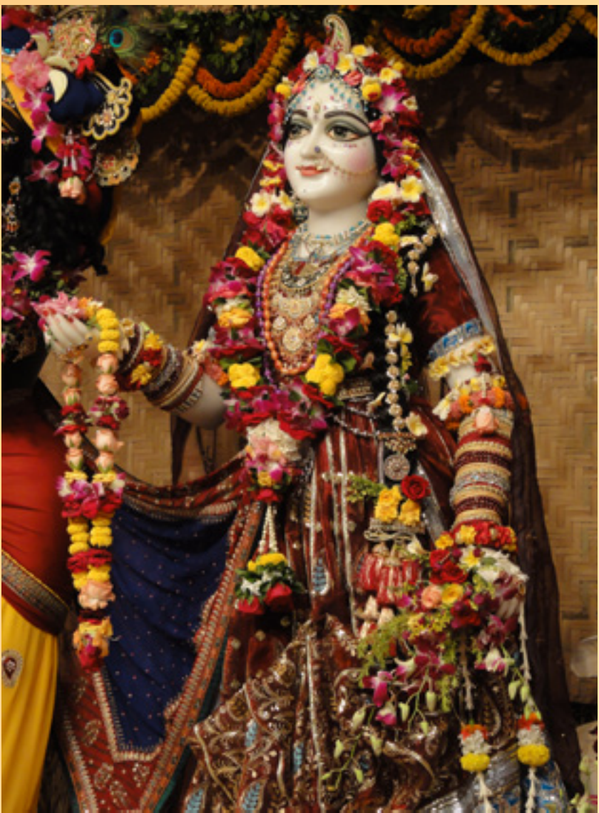
Srimati Radharani Gopastami Vesh